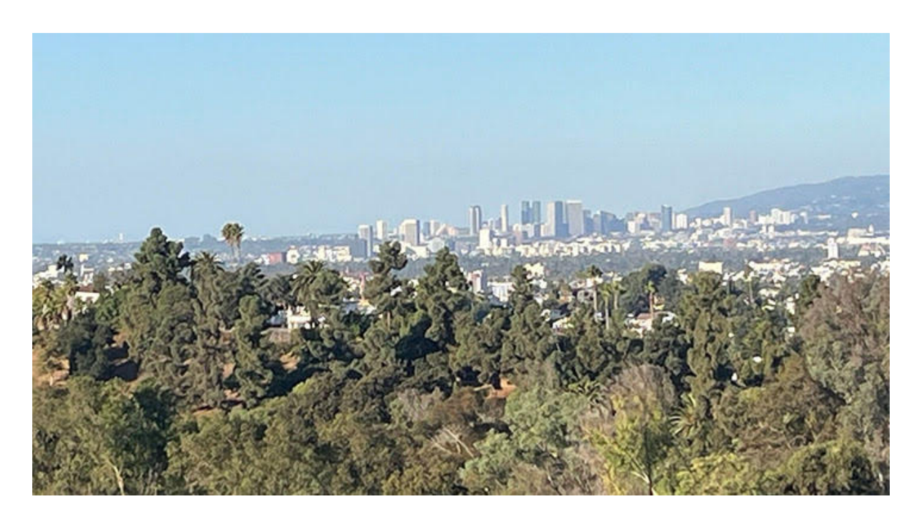
The route took the rides past the Griffith Park Observatory where Phil took this shot.