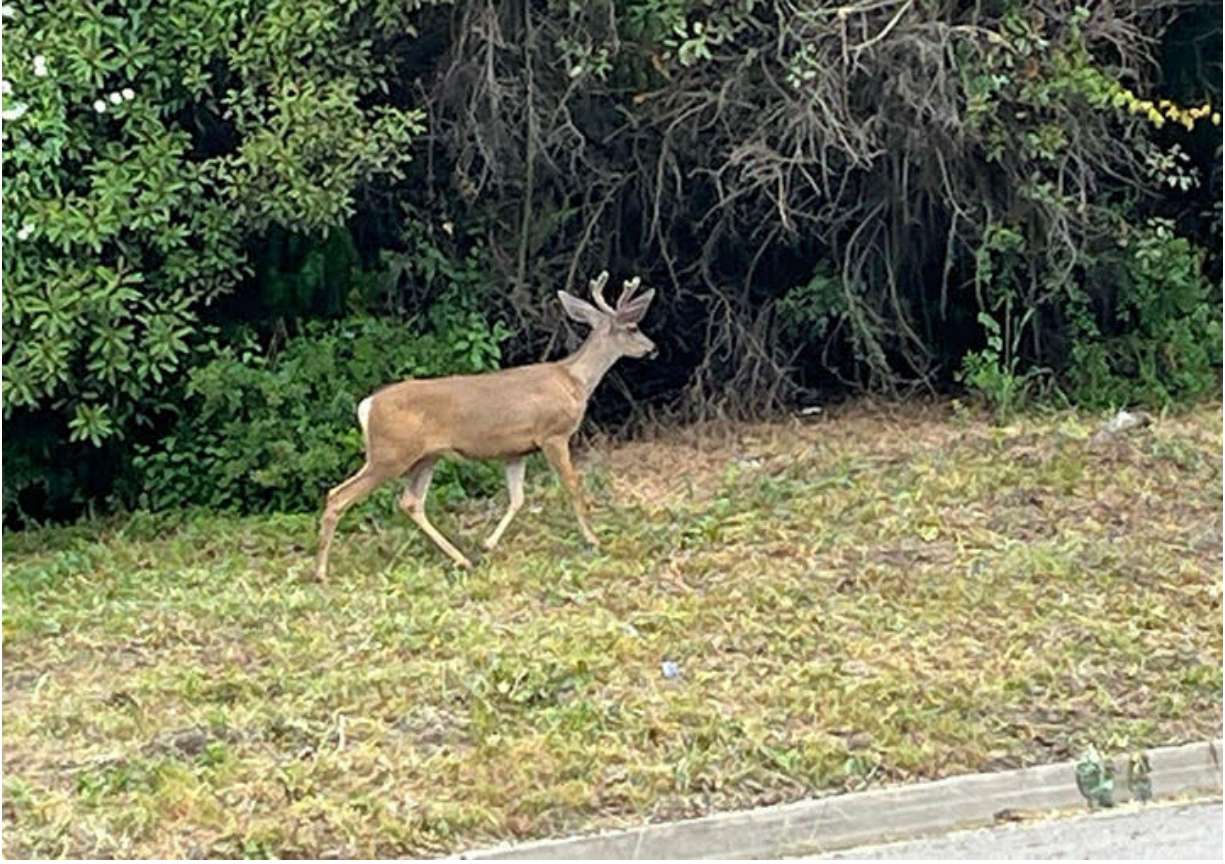
We all passed the "Great Wall of Los Angeles" and took photos of that. Here is one from Dale