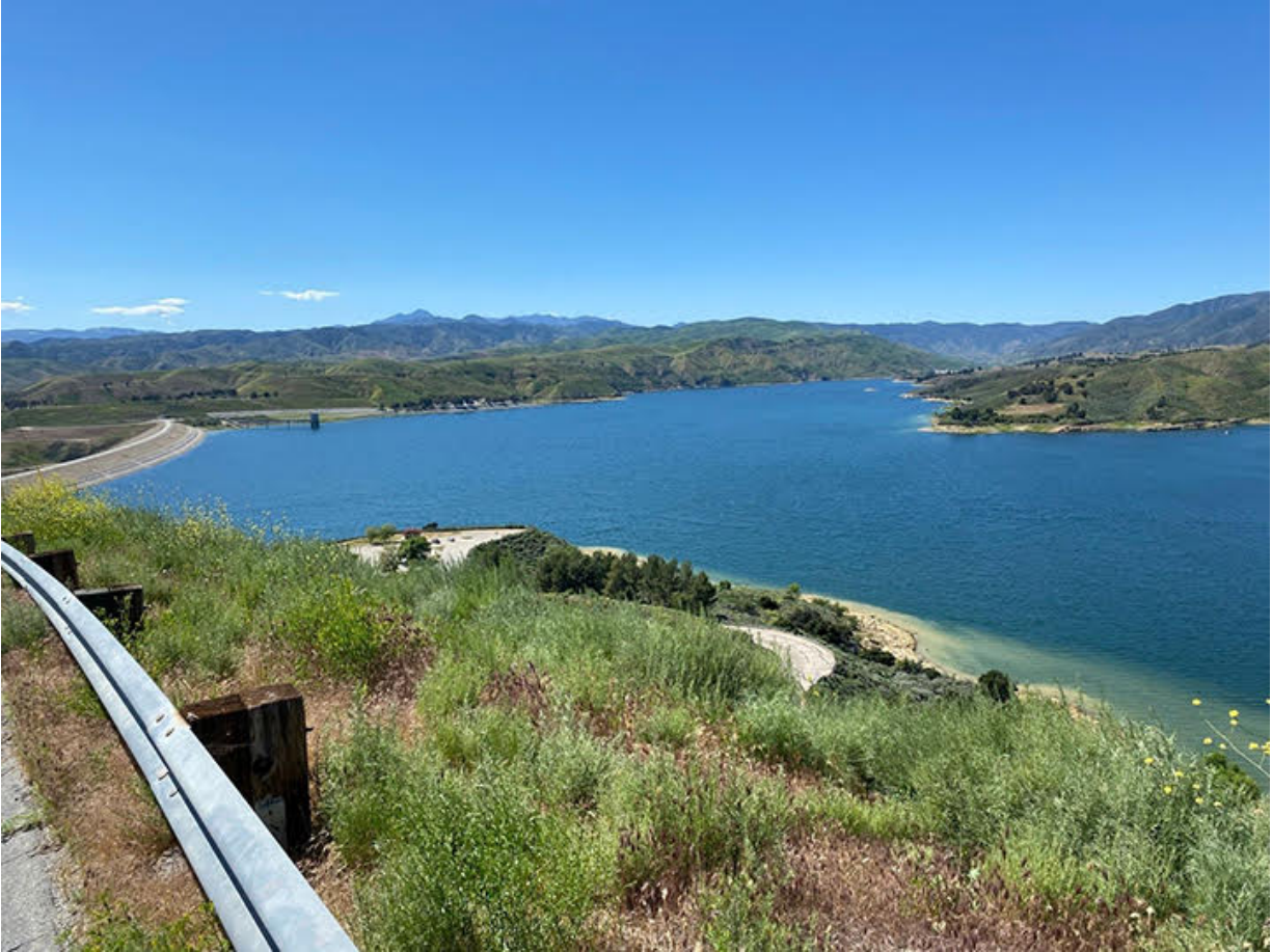
Castaic can also be filled with water from the north. As for the poppies, the reports a a poor flower year were apparently correct. Phil took this shot of the hills that in past years have been covered with poppies.